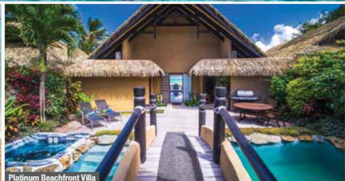
Platinum Beachfront Villa